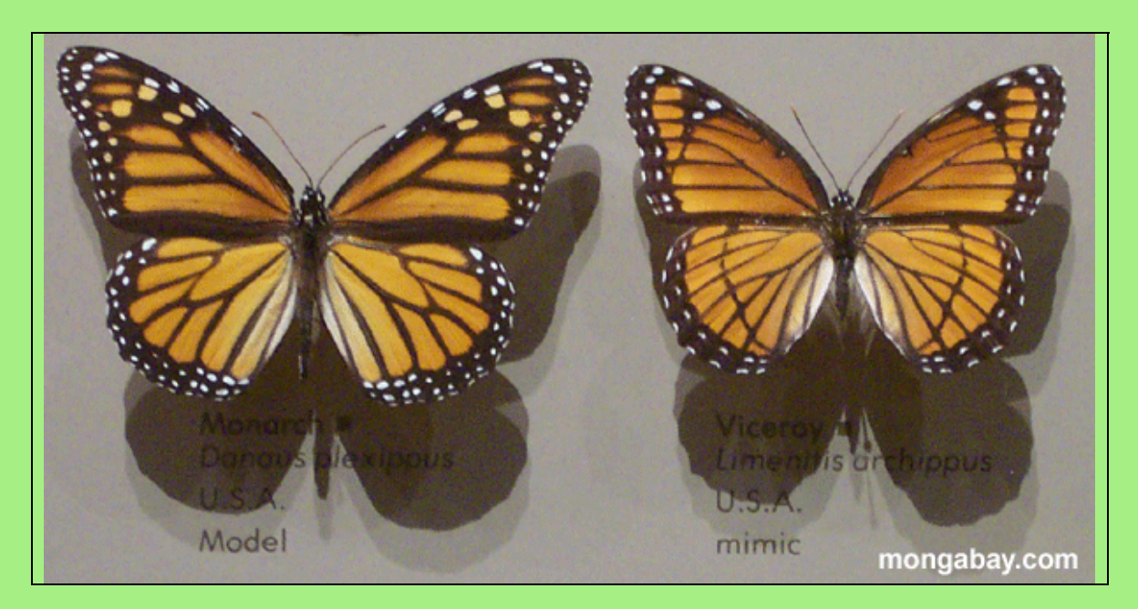
A well known instance is the Indonesian Papillio butterfly, whose females are able to mimic a number of other, foul tasting species. Another instance is of the Eastern Coral snake, a relative of the cobra and the mamba and found in some states of the USA. This

But the interesting part is with related butterfly species which do not have this kind of protection. The related species have evolved to have wing shapes and marking deceptively similar to the Heliconid. Predators that have learnt by bad experience to avoid the Heliconid then also stay away from the related, but quite palatable cousins! This kind of 'borrowed' protection, which has been found in many more instances, is now known as Batesian mimicry.