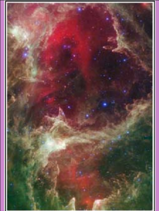
Green: dense clouds, Red: heated dust in cavities, White: regions where younger stars form. The oldest stars are blue dots in the centre of the cavities and younger stars line the rims of the cavities

While the collect and collapse theory was plausible and popular, there was no strong evidence for its truth till the Spitzer observatory first put forth a series of images in March 2005. The images were of a region about 17,200 light-years away from Earth in southern Milky Way and in the constellation Centaurus.