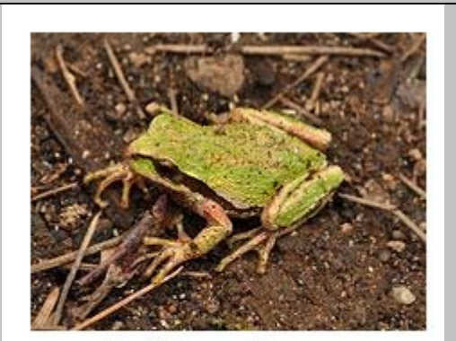
Pacific tree frog or Pacific Chorus frog